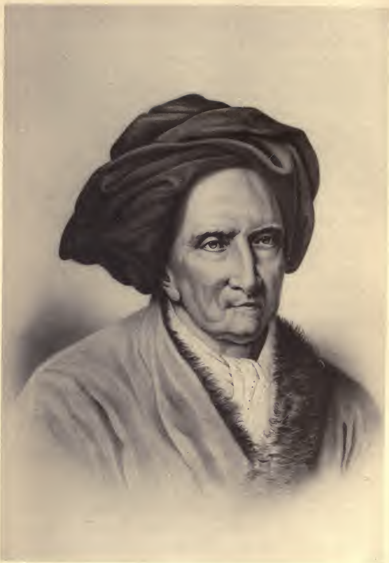
BERNARD LE BOVIER DE FONTENELLE.